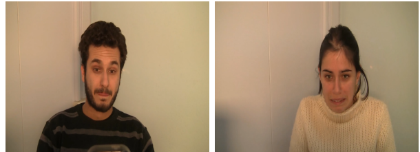
Fig. 2. Typical player responses to hard situations in IMB

sound played by IMB when the level begins, which was captured by the camera.