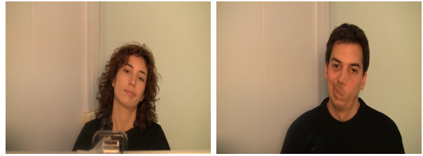
Fig. 1. Typical player responses to losing in IMB

In terms of technical equipment, we used a camera (Canon Legria S11) capable of recording high definition footage and good quality video in different lighting conditions, so as to minimize gain-related noise in the video signal when filming in environments with moderate lighting; the camera was placed behind the players’ screen, so as to capture body and head movement, as well as facial expressivity. HD video is a welcome feature for visual analysis of facial expressions and, especially, eye gaze, since the eye region is far too small and noisy to robustly estimate eye gaze when using even high quality web cameras. Synchronization of the video stream and the data logged by the game was based on the characteristic